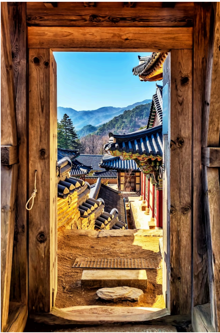
The entrance to Haeinsa Buddhist temple, South Korea