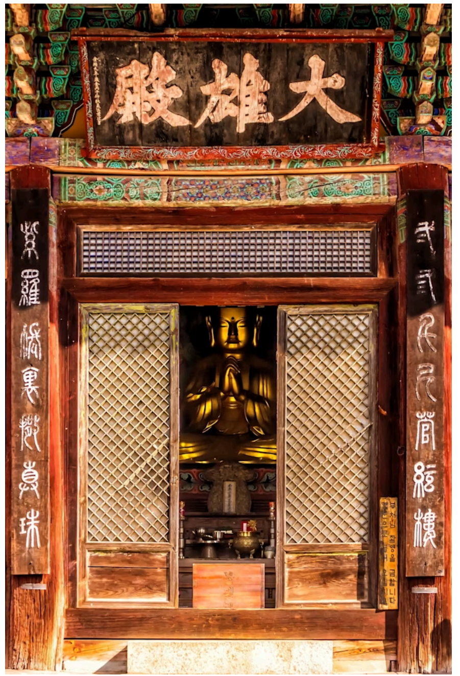
Carvings and a statue at the temple

You don't need to have caught the soda-popping demon hunters to know that South Korean culture is everywhere right now, from kimchi to K-pop. Cultural adventurers Wild Frontiers launch their first tour to the peninsula this March: a 12-night group trip time-travelling from the fast-forward capital to ancient temples, wandering through bamboo forests in Juknokwon, hiking the trails of the Mudeungsan National Park and cycling around the Daereungwon Tomb Complex along the way. South Korea's first coast-to-coast path, the 849km Dongseo Trail, is set to be completed by the end of 2026 too, if you want to step it up and come back for more of the country's wildly varied beauty. The 'South Korea: Secrets of the Peninsula' tour departs March 8, with further departures at dates until October; it costs from £5,590; wildfrontierstravel.com