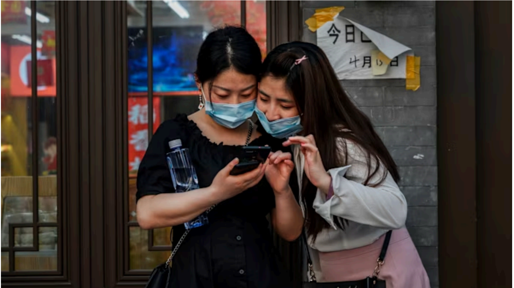
Dating apps are pivoting to Asia in search of growth

Rising numbers of 'goal-orientated' women are using the apps as stigma over online dating fades